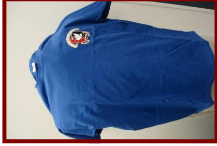
Guild Centenary t-shirt with school logo on front left breast and 'WHS Guild 1910 - 2010' on the back. Made from 100% cotton.