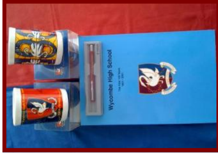
Bone China Mugs, Parker Roller Ball Pen, 'The First 100 Years of WHS'.