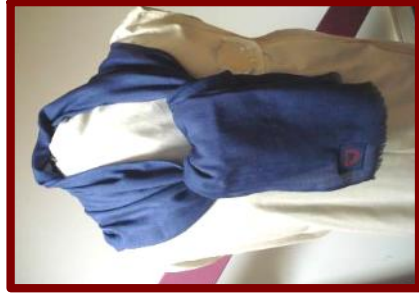
Pashmina with school logo in one corner. Made from 80% cashmere and 20% silk.