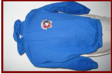
Hoodie with school logo on left breast. Made from 80% cotton and 20% acrylic.