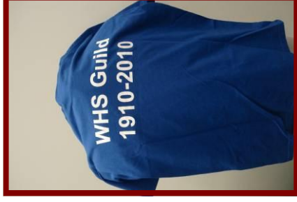
WHS Guild from its foundation in 1910 to its centenary.